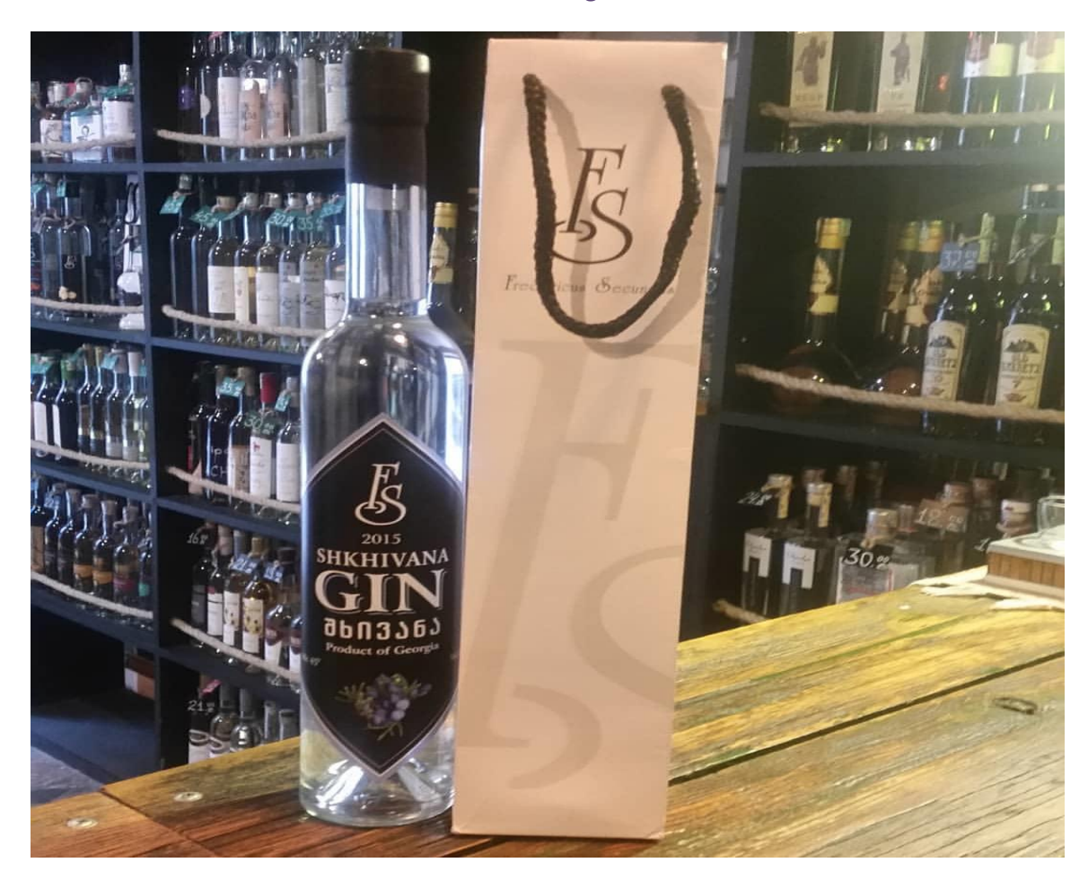
#MoC2019 #ICBSS #LocalDrink #Georgia #ShkhivanaGin

When the special plant "Juniper" was discovered in the village of Shkhivana in the Racha region of Georgia, an amazing idea presented! Georgian Gin! The high alcohol drink (45%) is made by grapes, juniper, a taste of citrus, pepper and grapefruit.