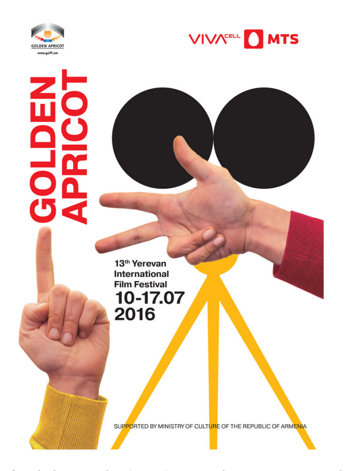
#BSEC25 #CultureBSEC #Cinema #Armenia

Golden Apricot International Film Festival became reality in Yerevan in 2004. The film festival was called so as the apricot symbolizes Armenia and it is an indispensable part of the country: a Latin name of an apricot is "prunus armeniaca" that means "the Armenian plum" and the colour of apricot is found in Armenian national flag. The Golden Apricot festival is different from other such events in the sense that it is smaller scale and more intimate, but it continues to garner international attention and respect. Golden Apricot Yerevan International Film Festival carries the theme: Crossroads of Cultures and Civilizations, promoting the dialogue. The films are presented in two international competition sections: features and documentaries.