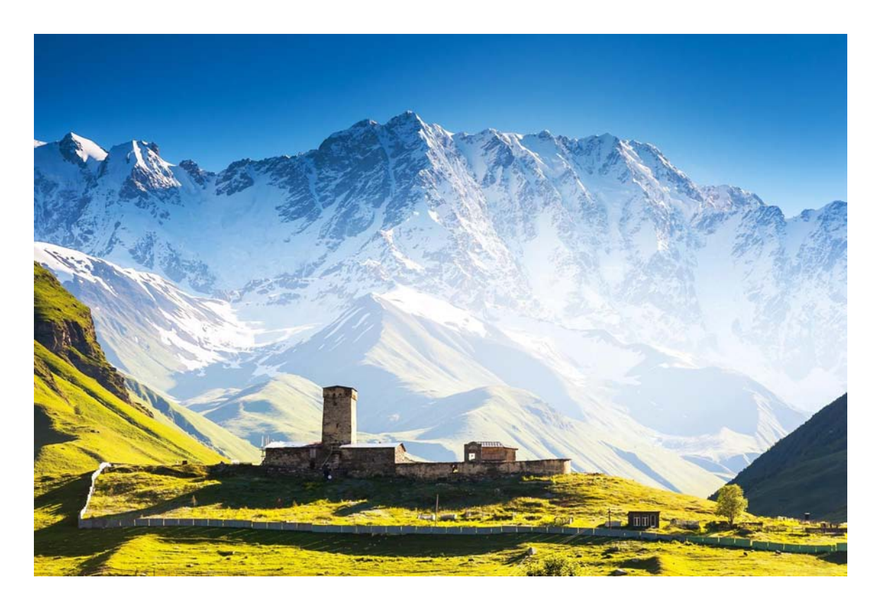
#MoC2018 #CultureBSEC #ICBSS20 #blacksea #monuments #Georgia