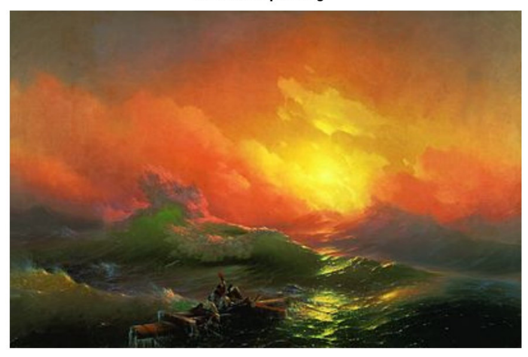
'The Ninth Wave' (1850) by Ivan Aivazovsky