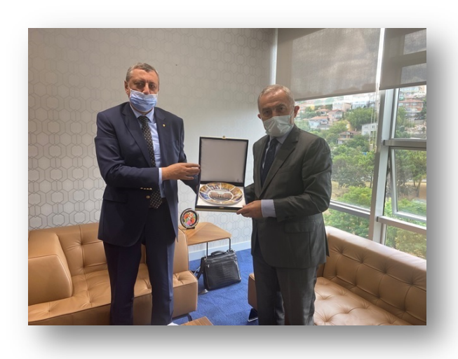
Visit by Mr. Andrey Buravov, Consul General of the Russian Federation in Istanbul, 7 September 2021.

Visit by Mr. Ehud Eitam, Acting Consul General of the State of Israel in Istanbul, 9 September 2021.