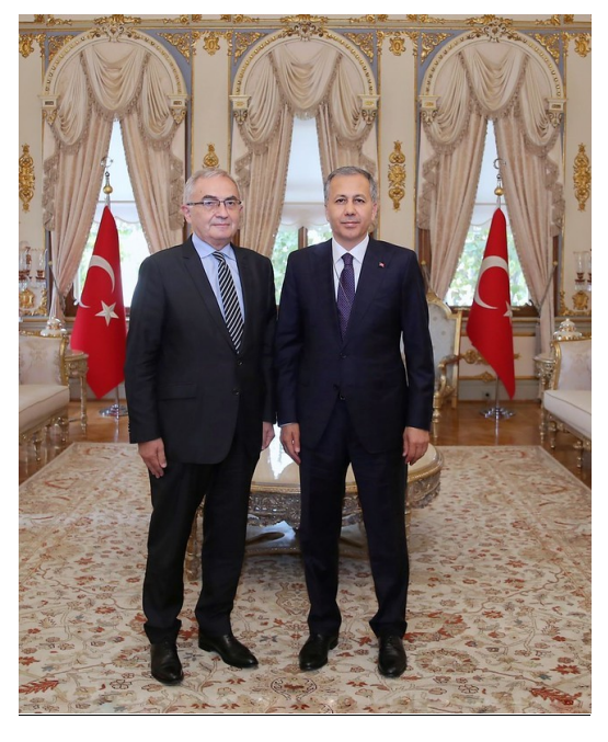
Visit to Mr. Ali Yerlikaya, Governor of Istanbul, 15 September 2021.

Ambassador Comanescu also paid curtesy visits to a number of local authorities.