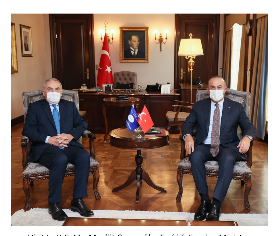
Visit to H.E. Mr. Mevlüt Çavuşoğlu, Turkish Foreign Minister.

The meeting provided a first hand opportunity for the Secretary General to convey his appreciation for the valuable support rendered by Turkey to his candidature. It also served for a fruitful exchange of views on some of the issues of priority in the future activities of the BSEC and in rendering the Organization ever more relevant and effective in the present international framework. The upcoming 30<sup>th</sup> Anniversary of the BSEC to be commemorated in 2022 was also discussed in this connection. Minister Çavuşoğlu reiterated Turkey's strong support to the BSEC objectives and activities and reassured the Secretary General of Turkey's full support in carrying out his mandate to further the aims and interests of the Organization.