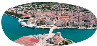
Island of Pag / Village Šimuni Croatia