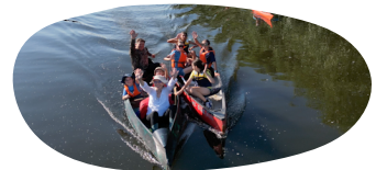
Danube Delta LAG Romania