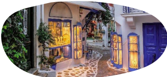
North Sporades Greece