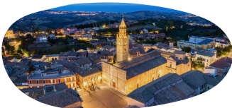
Province of Teramo Italy